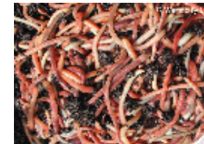
1 x Bag Of Worms / Worm Voucher