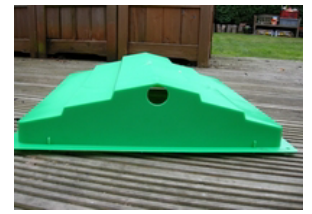
1 x Sump With Tap hole