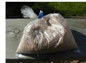
1 x Bag Of Worm Food