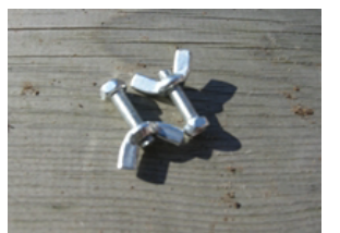
2 x Bolts & Wing nuts

Place the coir block into a large bucket or bowl. Pour 3 litres of warm water onto the coir and leave for approximately 30 min's. The coir will expand to 3 times its size and soak up all the water. Crumble up any remaining loose lumps of coir with a fork or your hands then squeeze out all the water. The coir should be as wet as a wrung out sponge.