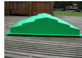
1 x Lid