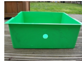
1 x Base Unit With Tap Hole