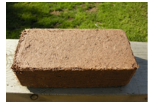
1 x Coir Block