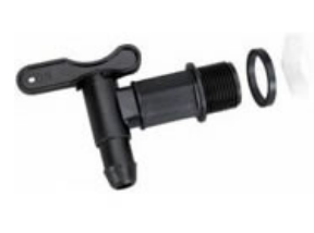
1 x Black Plastic Tap Back Nut